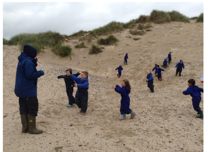
Eating lunch and blowing bubbles to warm up afterwards!